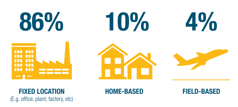
Chart 1: Main mode of work for employees in the UK